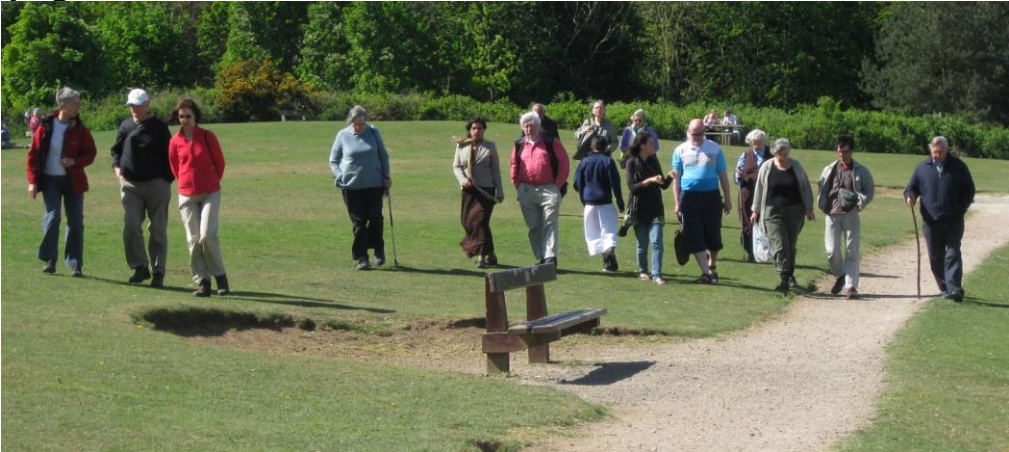
Coventry Friends on their May Day walk (see page 5)