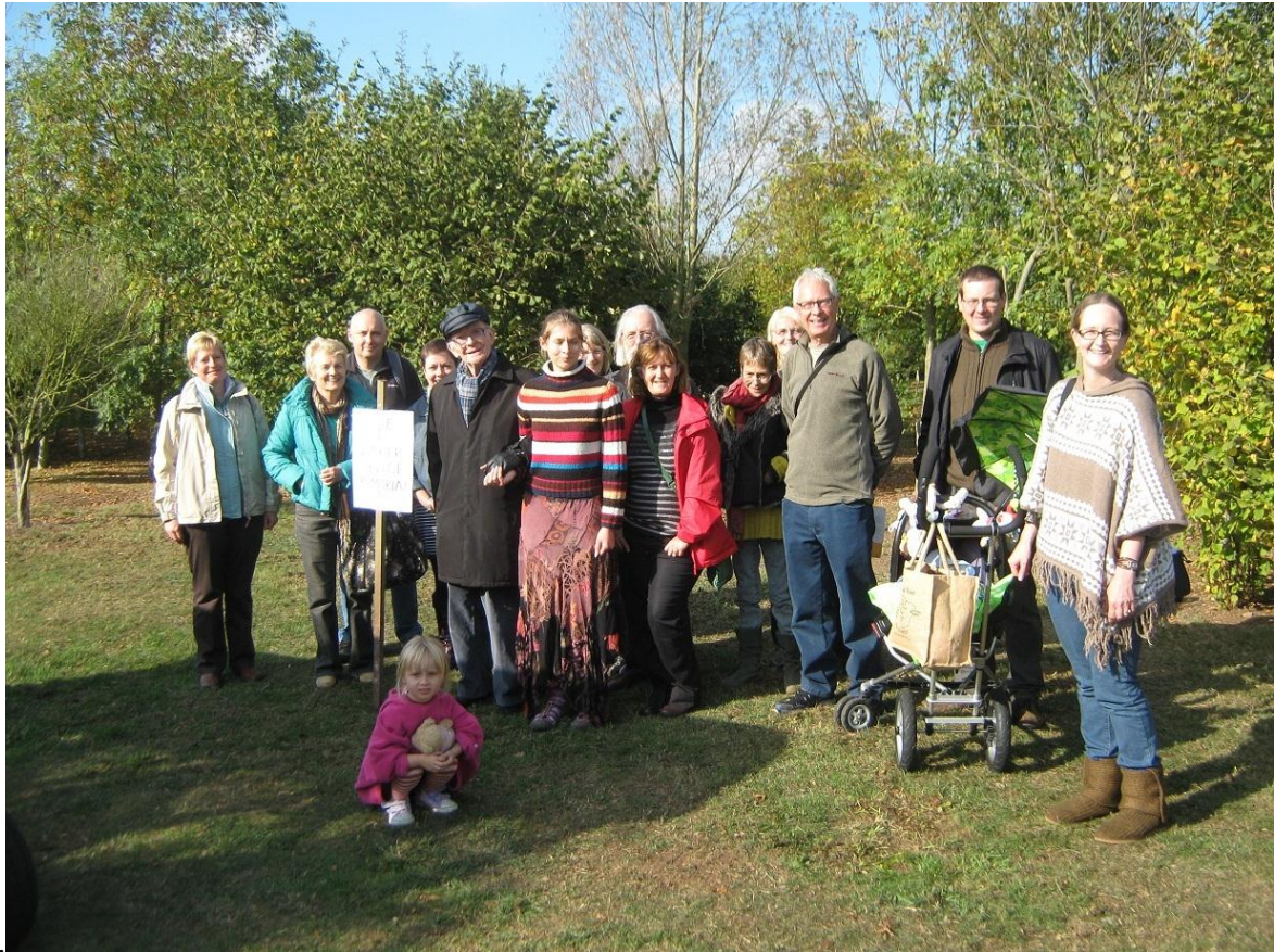
Central England Quakers gather at the site of the Quaker Memorial at the National Memorial Arboretum on 15 October