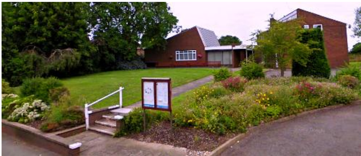
Hartshill Meeting House - built in 1972 to replace the old Meeting House, now a private house, which stands nearby